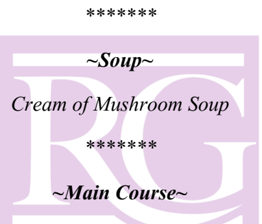
Traditional Roast Stuffed Turkey & Baked Ham

Topped with Roast Pine Kernels and Tarragon Vinaigrette